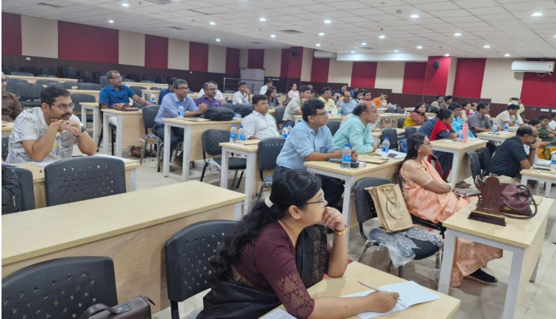
The Audience, comprising with faculty members & doctors of different disciplines of JGMCH & other medical colleges, doctors of WBHS & WPHS cadres